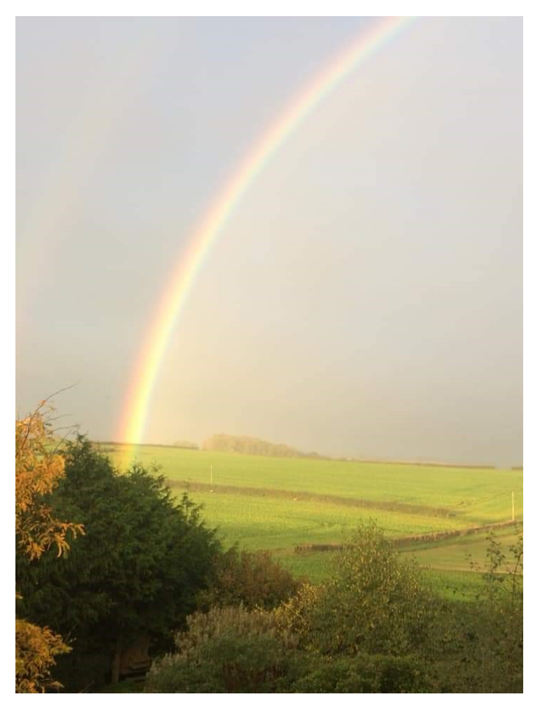
A rainbow on Waterston Ridge

[Stinsford Parish Council, version 2.2 agreed on 12 October 2021 and updated on 8 August 2022]